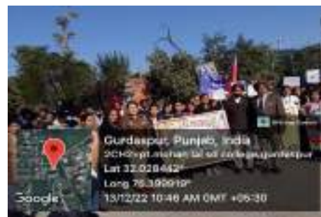
‘Awareness rally on Swachh Bharat and Drug Abuse’