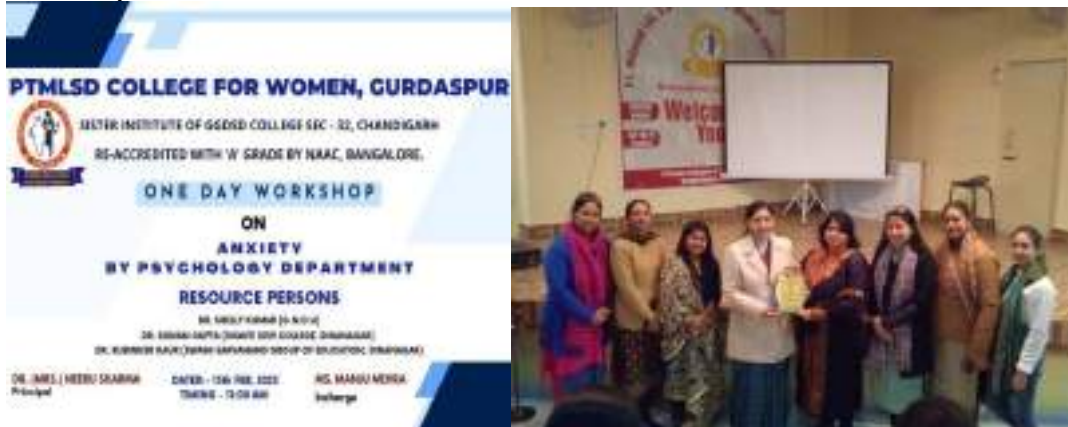
Workshop on 'Anxiety'

Principal, Swami Sarvanand Group of Education, Dinanagar. 20 students attended this workshop.