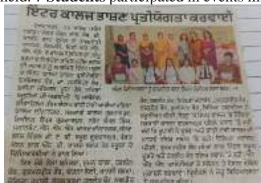
Inter-college and inter-school competition

Principal Pt. Mohan Lal S.D. College for Women, Gurdaspur