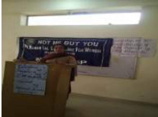
Quiz Competition and Declamation Contest