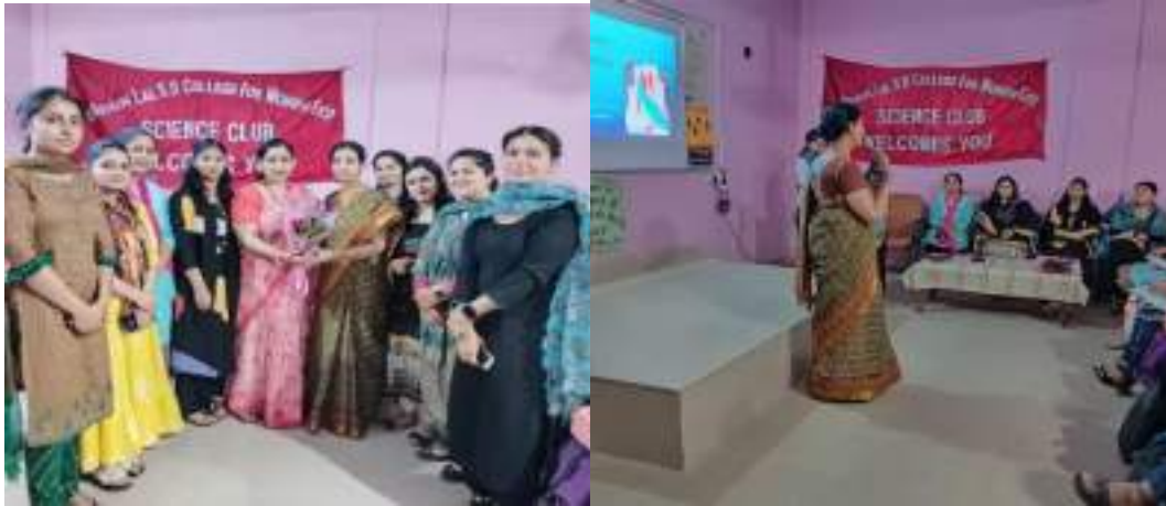
Lecture on Cervical Cancer