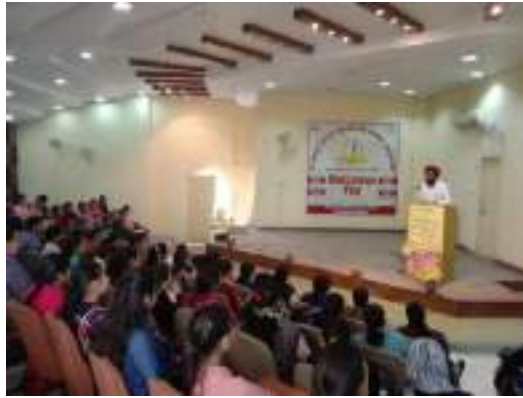
NSS organized a seminar on the 'National Education Day'