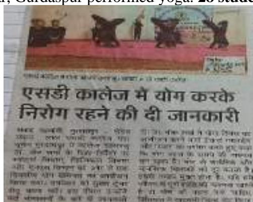
Workshop on 'Importance of Yoga'