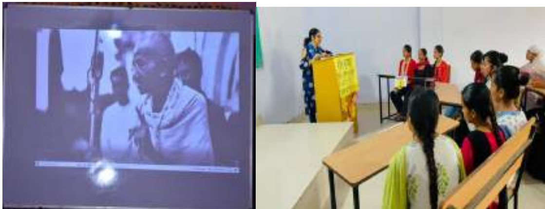
650 th Birth Anniversary of Mahatma Gandhi