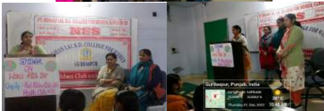
Awareness program on AIDS