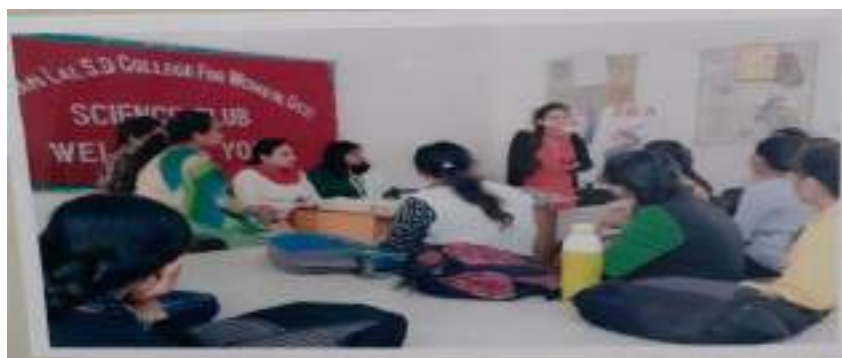
Seminar on ‘Anti-Drug’