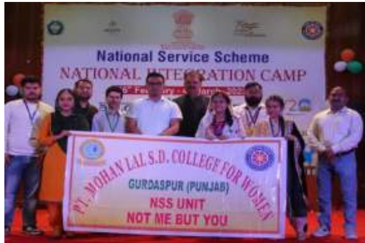
National Camp at Hisar