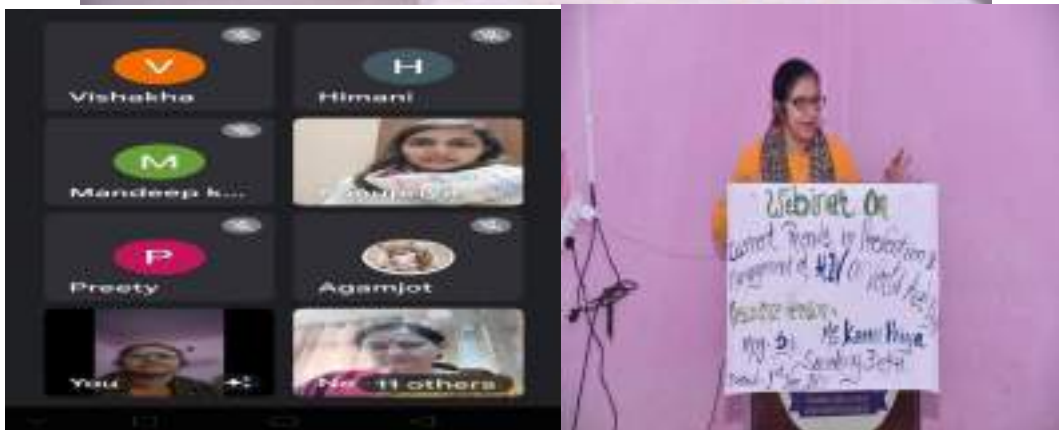
Sensitizing students on Aids