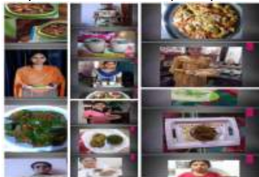
5 day event under ‘Poshan Pakhwada-2021’