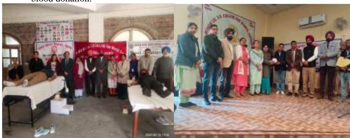
Blood donation and lecture on Drug awareness and HIV AIDS