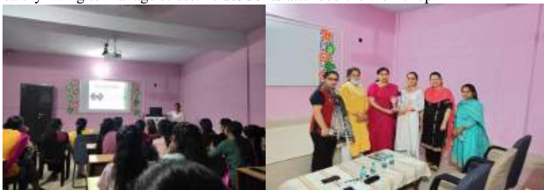
Workshop for students on ‘Stress Management’