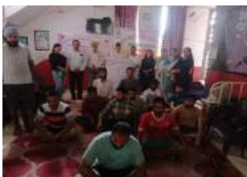
Awareness programme on Nasha Mukti Bharat