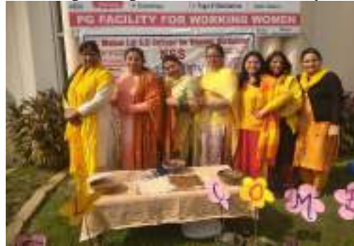
Basant Panchmi was celebrated