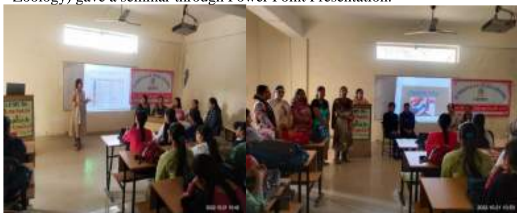
Lecture on benefits of Blood Donation

Principal Principal Pt. Mohan Lal S.D. College for Women, Gurdaspur