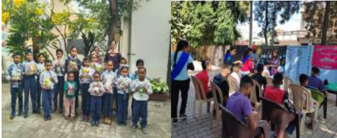
Visit to Orphanage home