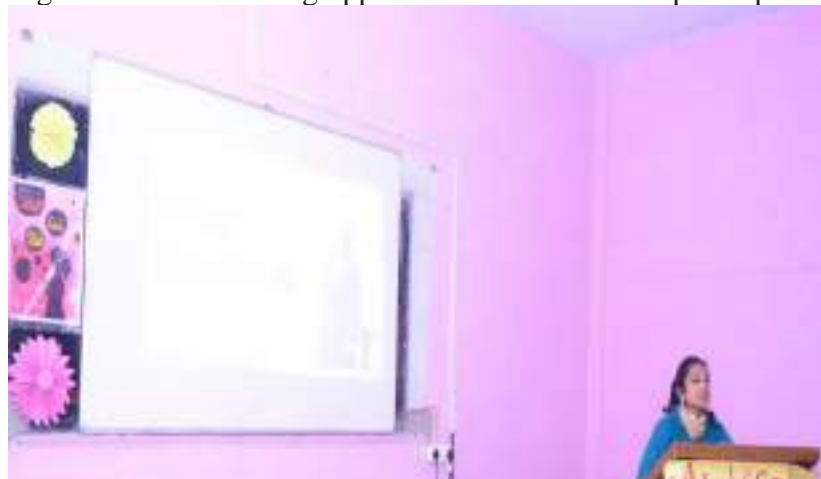
NSS unit celebrated birth anniversary of Swami vivekanand Ji

Principal Principal Pt. Mohan Lal S.D. College for Women, Gurdaspur