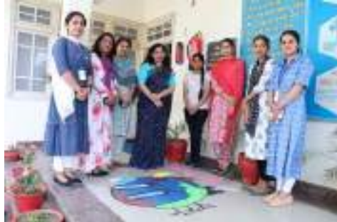
NSS unit of college in collaboration Ministry of Education celebrated World Environment Day