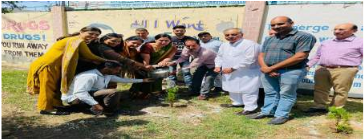
Youth Club of the college in collaboration with Jai Hind Sewa Club, Gurdaspur held a plantation drive