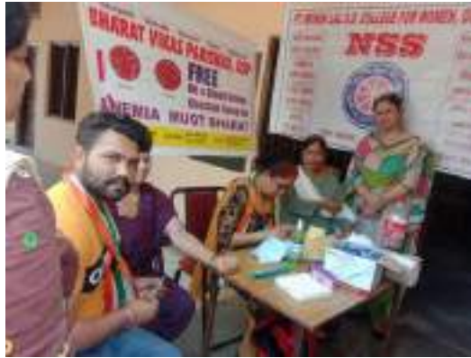
HB and Blood group check up camp