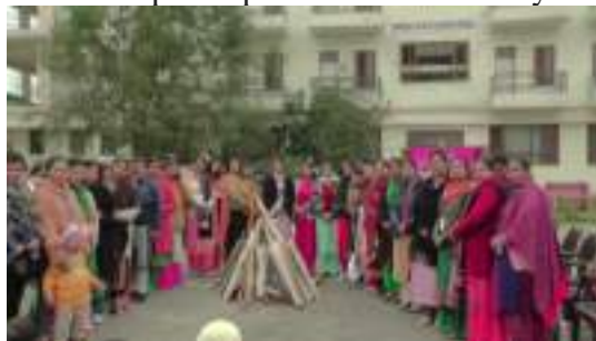
Lohri project 'Samvedna' was organized by Central Association