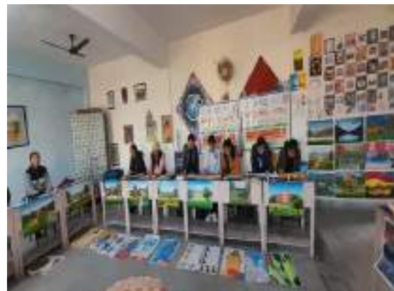
'Beti Bachao, Beti Padhao'