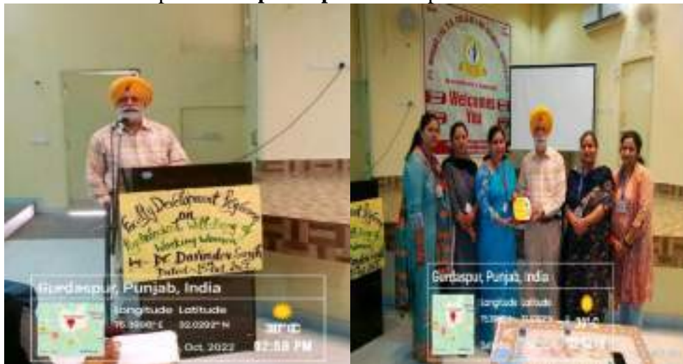
Holistic development of faculty through programme on 'Psychological Well-being of Working Women'

Principal Principal Pt. Mohan Lal S.D. College for Women, Gurdaspur