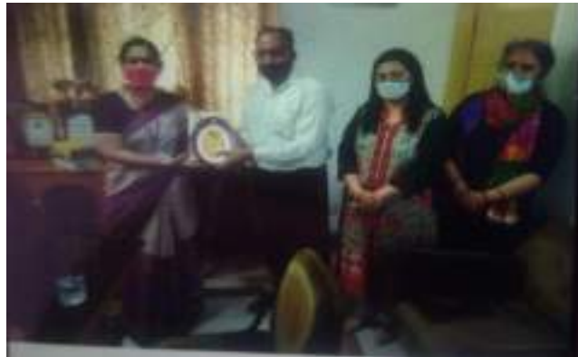
Lecture on ‘Holistic Healing’