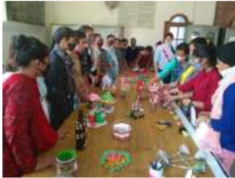
Project 'Best out of Waste'