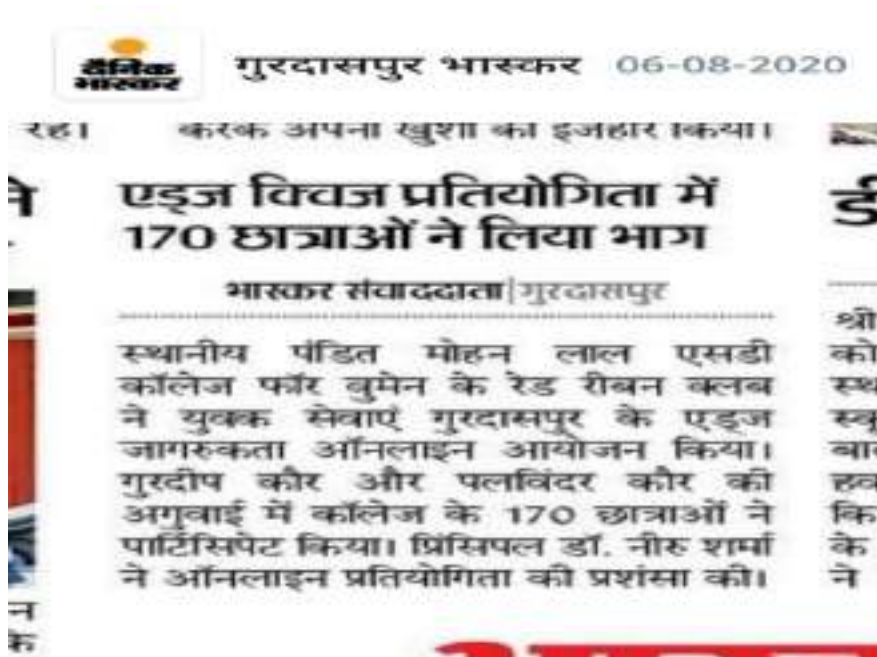
Quiz competition on HIV/AIDS awareness