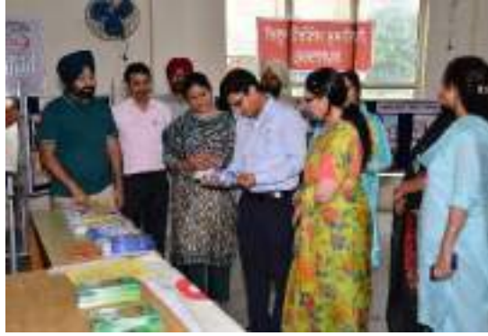
'Panch Pran and India@ 2047'