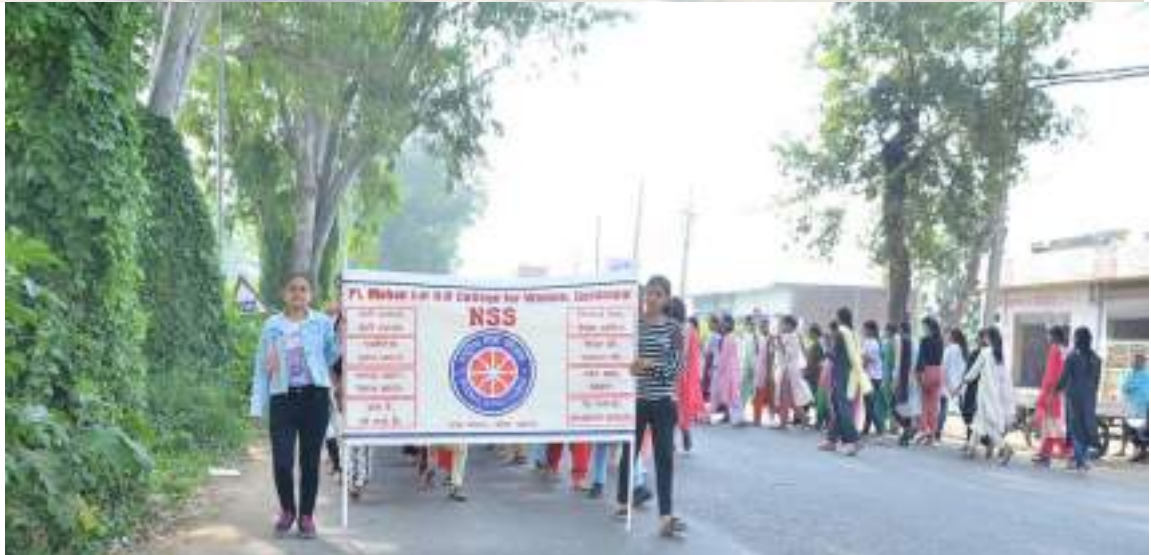
Rally by NSS and Swatch committee