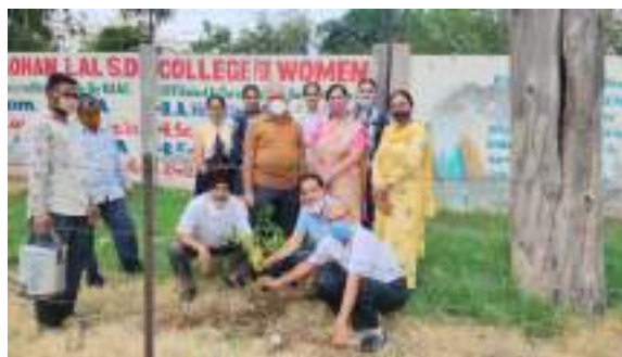
NSS celebrate Van Mahotsav