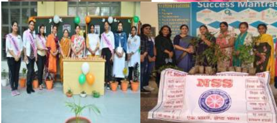
'Azadi Ka Mahotsav'