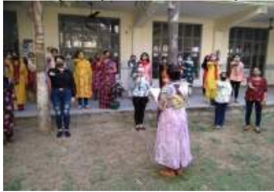
Safety measures of COVID-19 on 8 th Oct, 2020