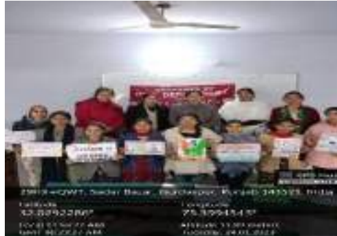
126 th Birth Anniversary of Neta Ji Subash Chandra Bose