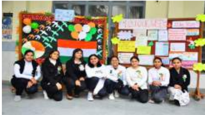
Poster making competition on Republic Day