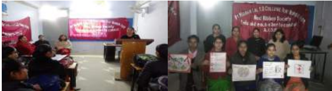
‘World AIDS Day’ celebrated by Health Club and Red Ribbon Club