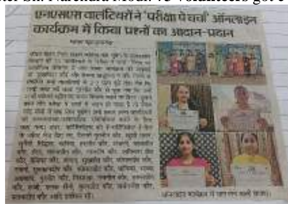
‘Parishka Pe Charcha’ program

(Signature) Principal Pt. Mohan Lal S.D. College for Women, Gurdaspur