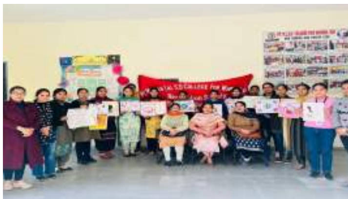
Poster making competition on Drug Awareness

competition. They prepared posters on different topics like say no to drugs, against drug abuse, drugs take you to hell, disguised as heaven etc.