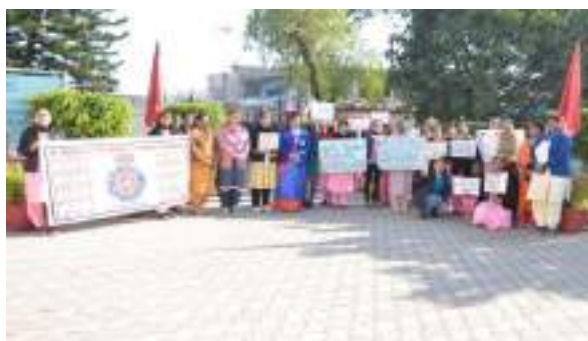
Rally on World Human Rights Day