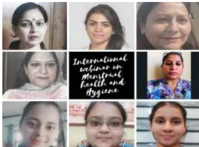
International webinar on ‘Menstrual Health and Hygiene’