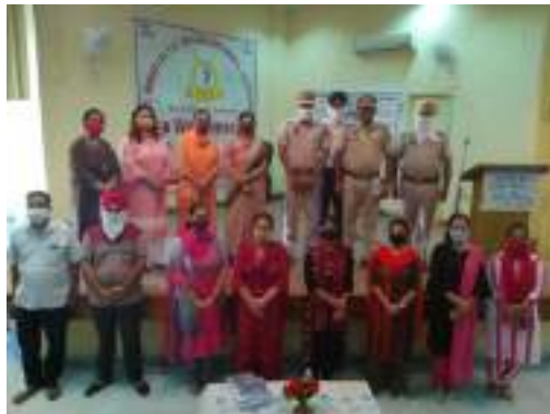
Seminar on Traffic rules was organized on 13 th Oct, 2020