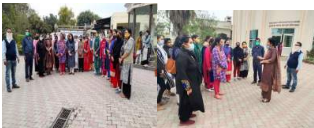
Administrative members of Civil Hospital, Babri Gurdaspur at campus during Covid-19