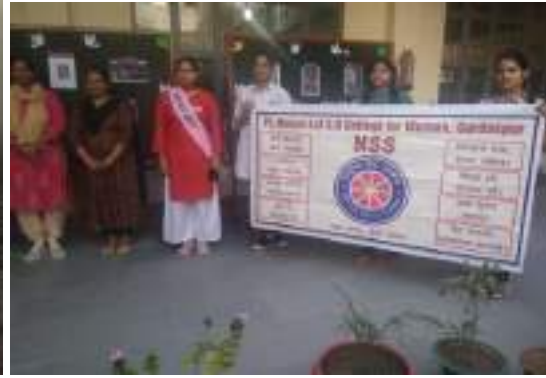
National Integration Day