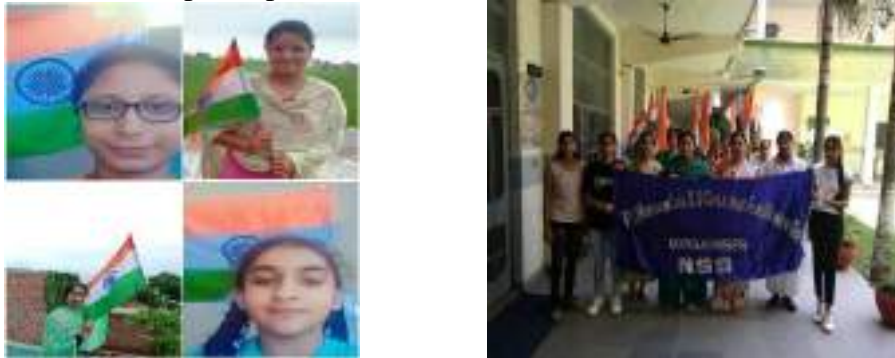
75 th year of India's Independence as 'Azadi ka Amrit Mahotsav'