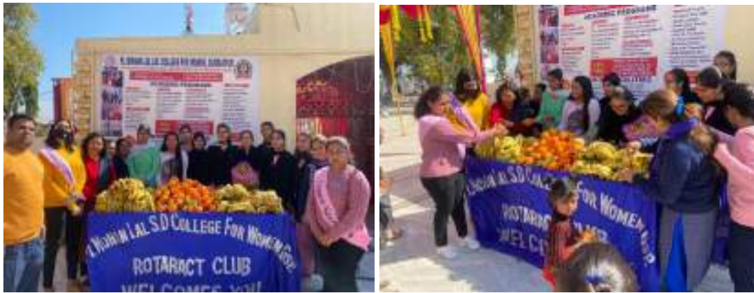
Mahashivratri at Kalanaur Mandir