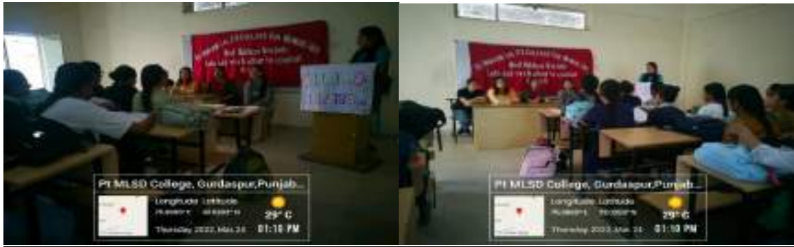
Seminar on 'World T.B Day'