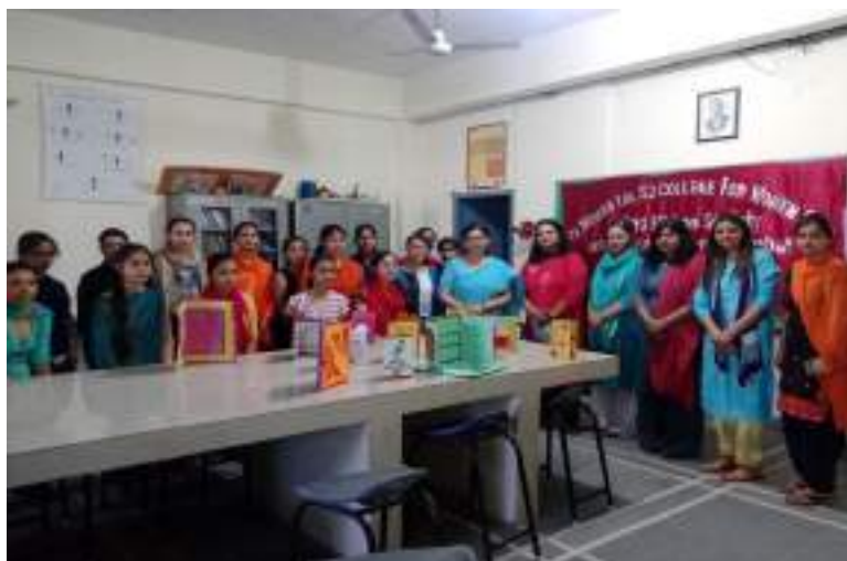
‘World Red Cross Day’ celebrated by Health Club and Red Ribbon Club