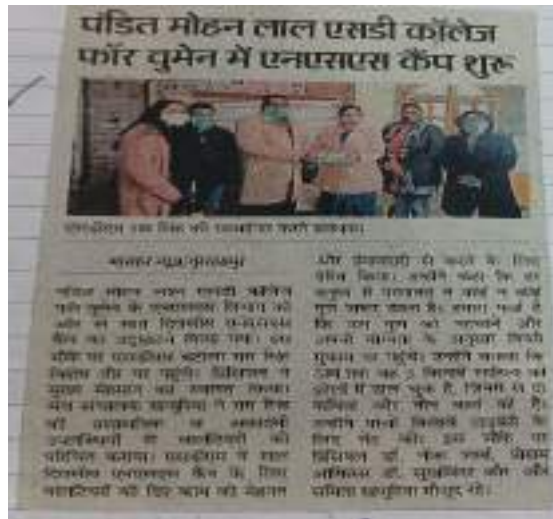
Activities of NSS camp