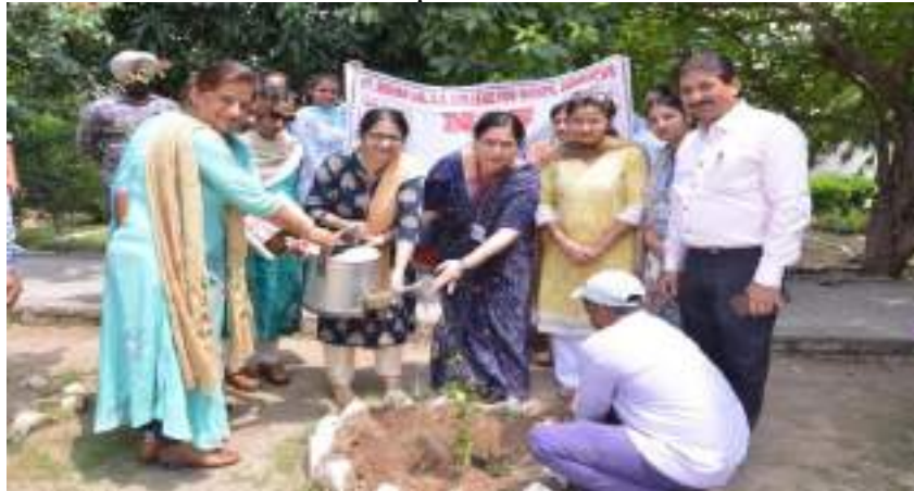
Plantation drive organized by NSS and Red Ribbon Club