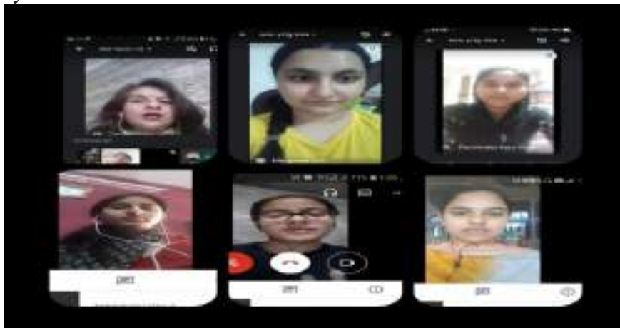
Quiz on ‘Andhra Pradesh Culture’