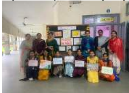
NSS and Music Department offered tribute to Shaheed Bhagat Singh