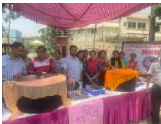
NSS Volunteers organized 'Chabeel'