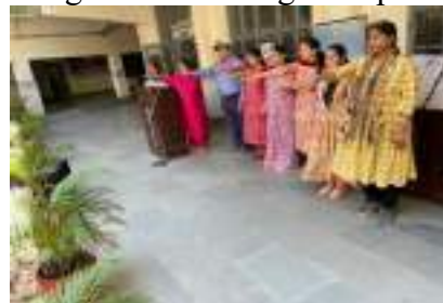
Environment Association and NSS organized a plantation drive