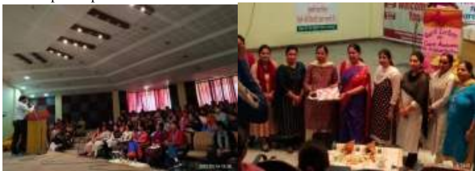
Cancer Awareness Programme

Principal Principal Pt. Mohan Lal S.D. College for Women, Gurdaspur