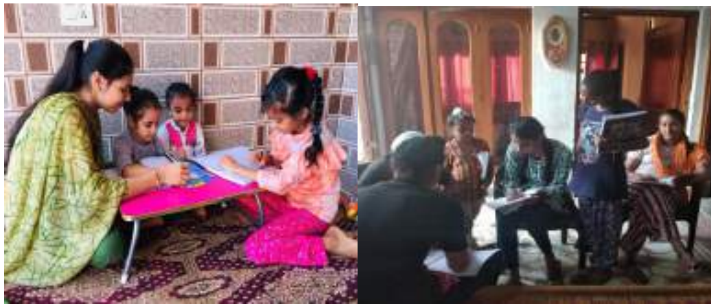
NSS Department of the college-educated the people in slum areas