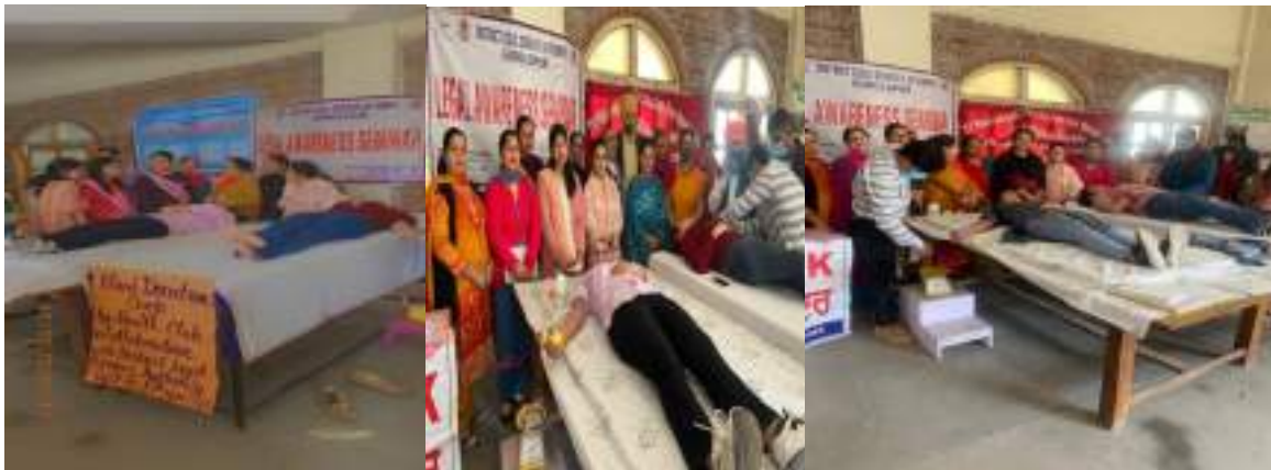
Blood donation camp