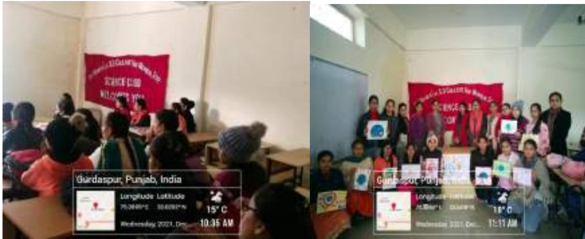
Poster making competition on 'World AIDS Day'