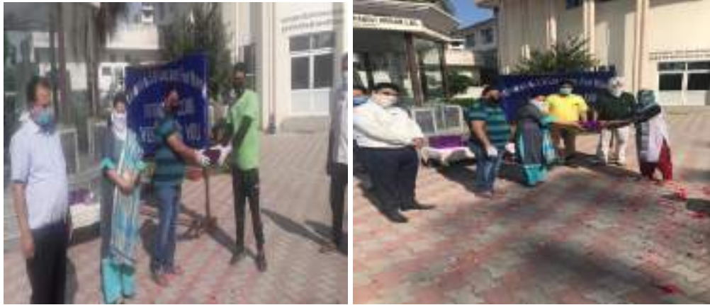
Honored the real warriors of COVID-19