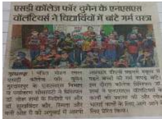
NSS Club distributed woolen clothes to needy students