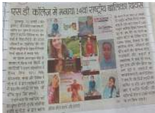
Celebrating ‘National Girl Child Day’