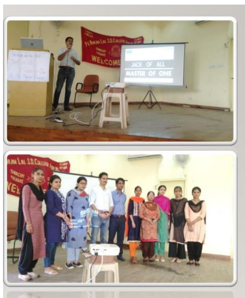
Seminar on 'Jack of all master of one in IT world' on 17th Sept, 2018