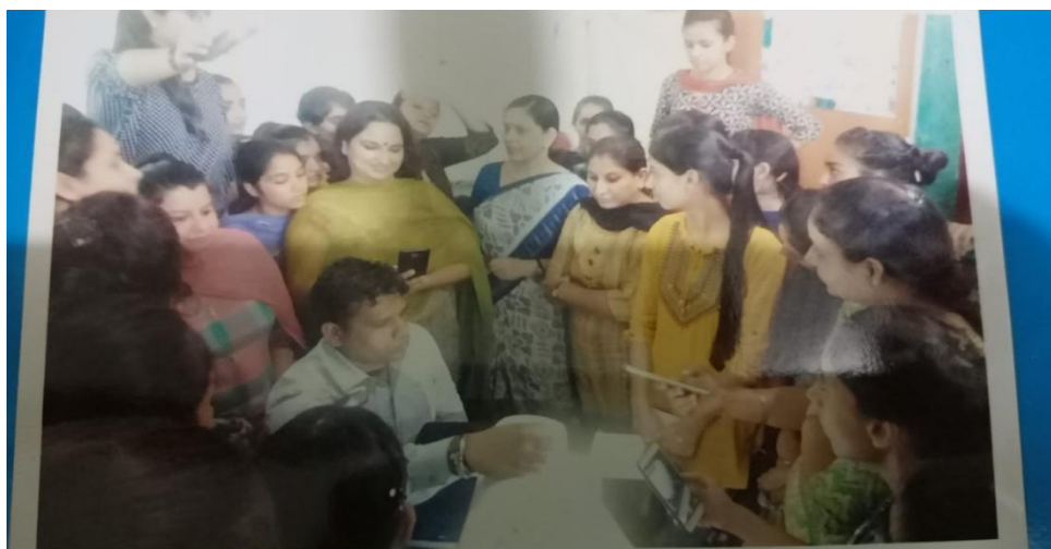
Workshop on 'Sewing Machine' on 27th August, 2018