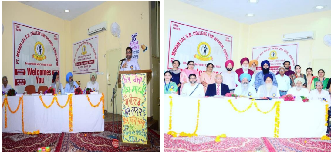
International Seminar on 'Guru Nanak Ek Yug Purush' on 5th Nov, 2019

10. The sociology department and Hindi Department of the college in collaboration with District Legal Authorities conducted a webinar for college students on NALSA schemes and handling the stress of COVID-19 on 30th September 2020. Honorable Judge Rana Kanwardeep Kaur and Advocate Gurnal Pannu graced the occasion and acted as the resource person. They elaborated on the various schemes under the NALSA project.