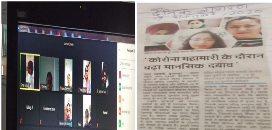
Webinar on NALSA Schemes and handling stress during COVID-19 on 30th Sept, 2020

10. The sociology department and Hindi Department of the college in collaboration with District Legal Authorities conducted a webinar for college students on NALSA schemes and handling the stress of COVID-19 on 30th September 2020. Honorable Judge Rana Kanwardeep Kaur and Advocate Gurnal Pannu graced the occasion and acted as the resource person. They elaborated on the various schemes under the NALSA project.