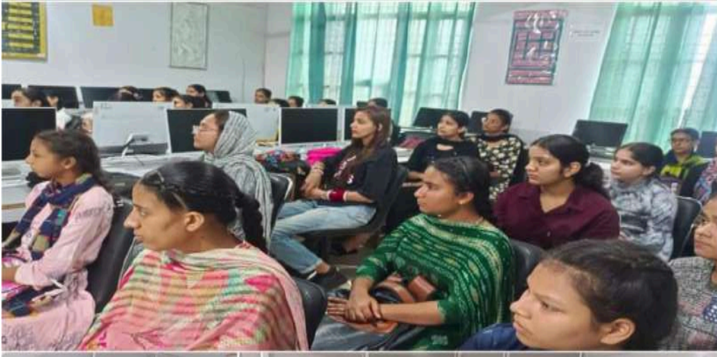
One day workshop on Hardware and Software devices

One day workshop on Hardware and Software devices by Computer Science Department