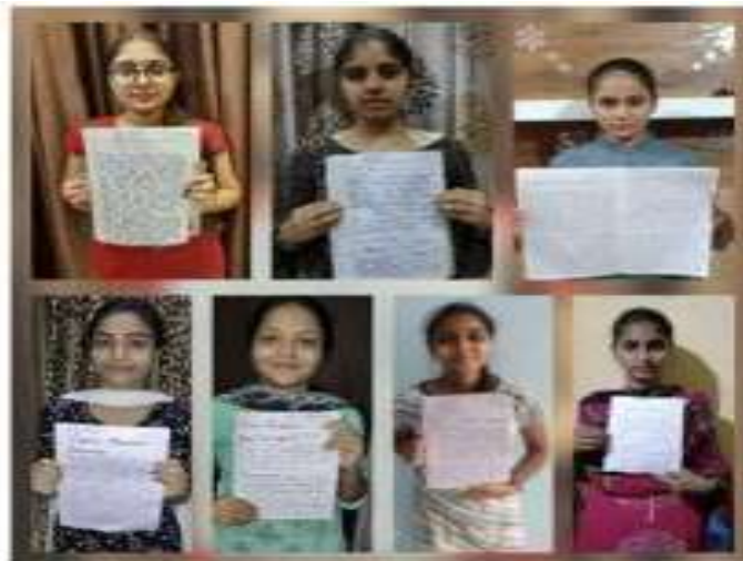
Essay Writing competition on E waste management