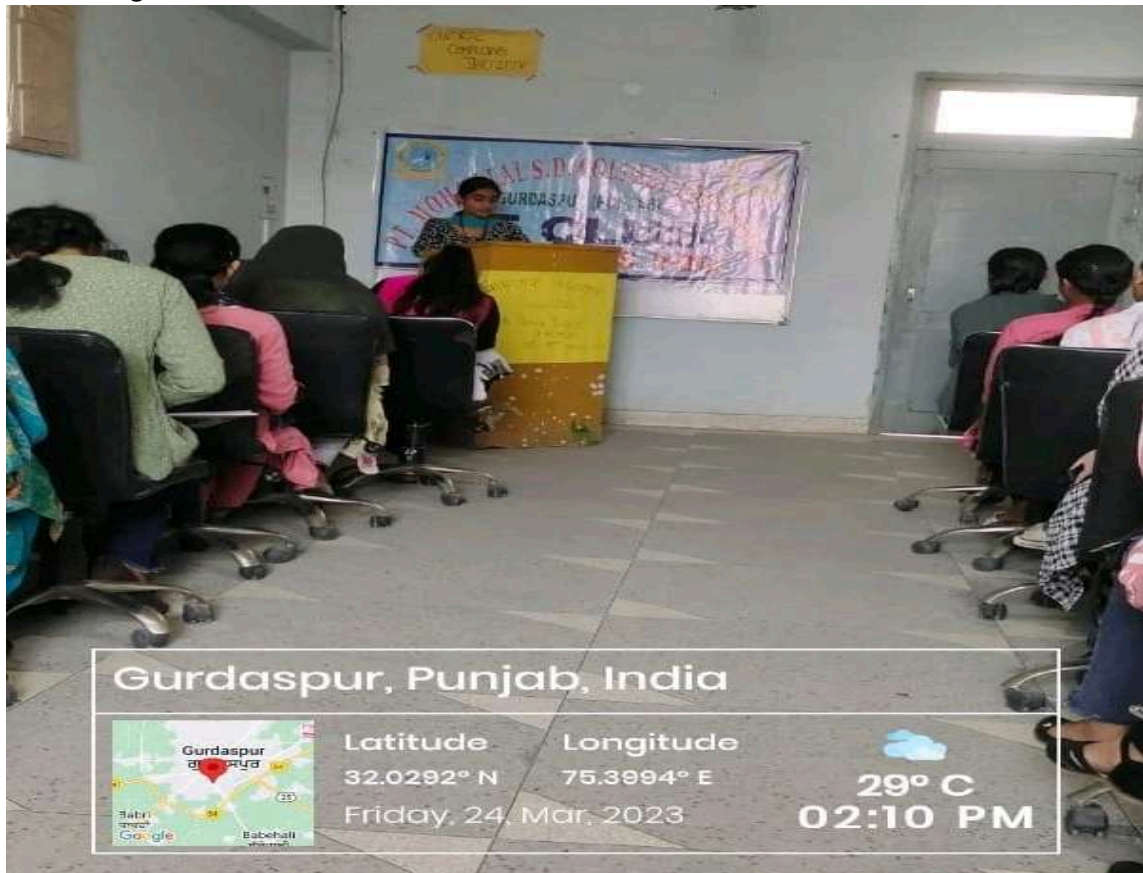
Interactive Programme Week

The week-long event witnessed active participation from students of different semesters, showcasing their talents and skills in various technical domains.