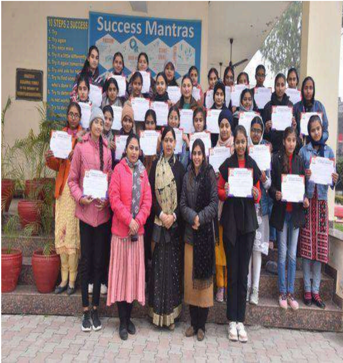
Skill Development Courses on C/C++ and Web Designing.

Keeping in mind the guidelines of NEP, under the realm of IQAC, the Department of Computer Science organized two Skill Development Courses on C/C++ and Web Designing. 50 students were enrolled for these courses from the college. The main purpose of these courses was to develop programming skills among students.