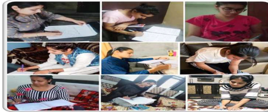
“Online Essay Writing” competition on the topic “How Countries are using Technology to fight CoronaVirus”

The Computer Department organized an Essay Writing Competition during the lockdown period on the topic“ How countries are using technology to fight Coronavirus”, in which students of BCA, B.A.(Comp App), M.Sc participated. The students elaborated their views about usage of robots, drones, CCTVs and various mobile apps available to flight against Covid-19.