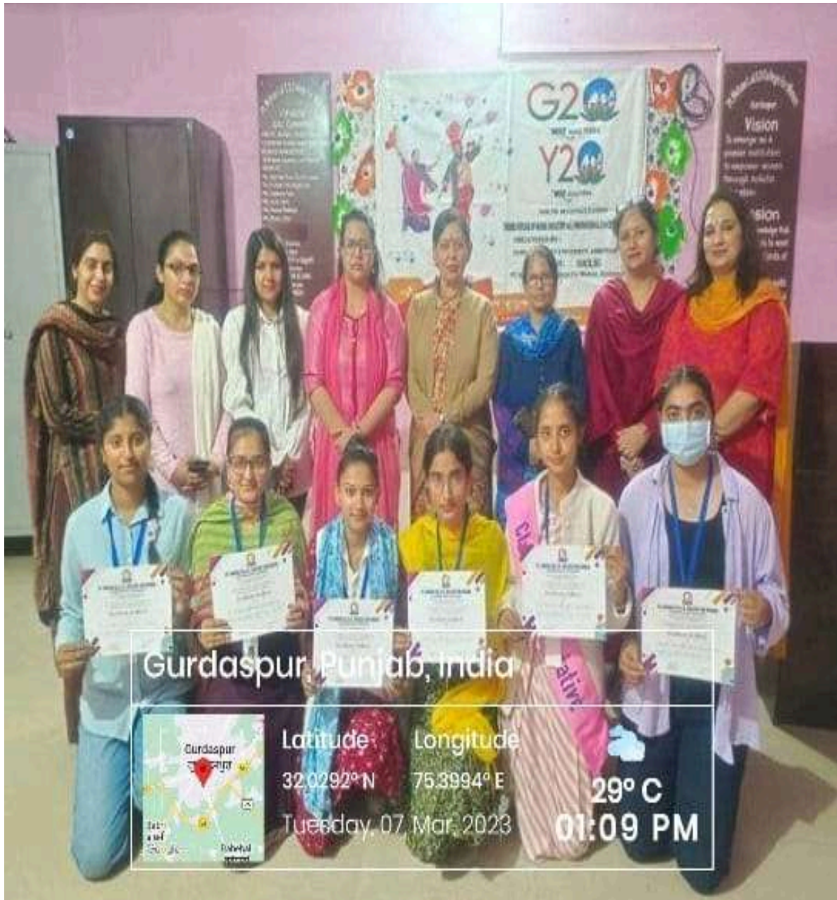
‘Innovation in Technology and Job Security’

The Computer Science dept. organized a quiz competition on theme ‘Innovation in Technology and Job Security’. The aim of the competition was to promote awareness and understanding of the latest developments in the field of technology and their impact on job security. There were four teams.