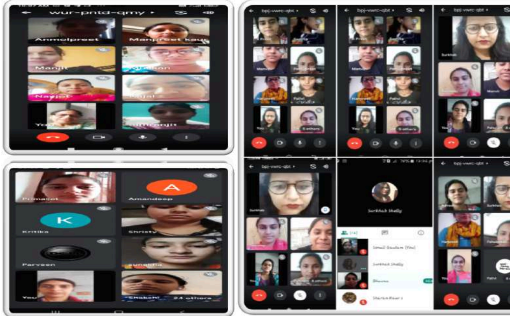
Interactive Programme week

Online “Interactive Programme Week” was organized by the Computer Science Department. The program was on “Social Network Sites” in which all the members of the department delivered lectures, Seminars and conducted Group Discussions, Quiz & Presentations.