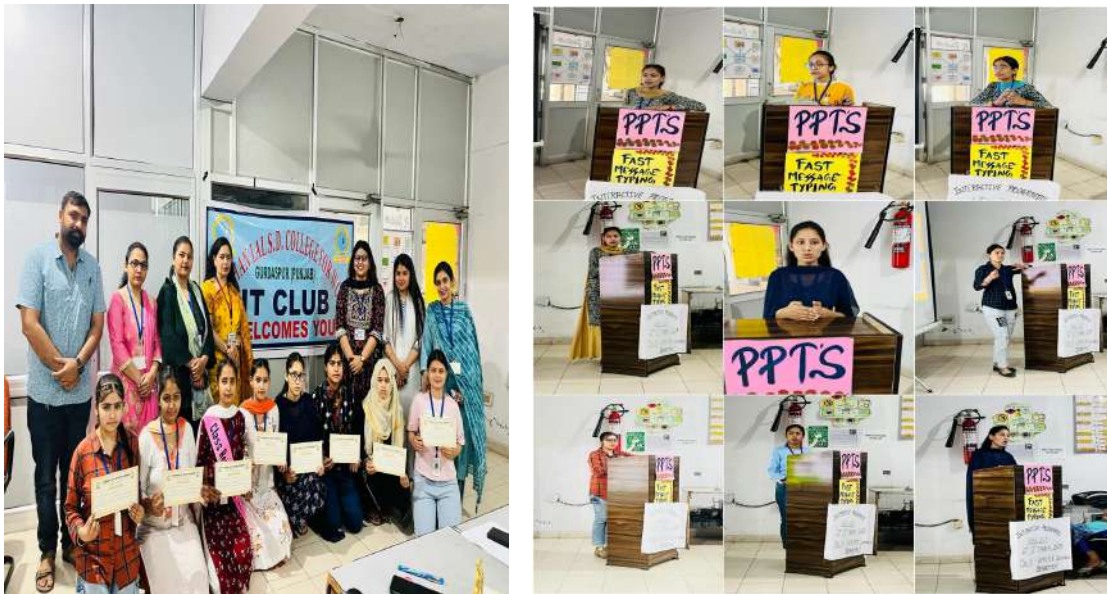
'Interactive Programme Week'