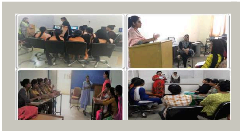
Interactive week on social network sites

An “Interactive Programme Week” was organized by the Computer Science Department in which Quiz, Seminars, Group Discussions, Presentations were organized and students participated in it enthusiastically.