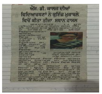
World Environment Day On 4<sup>th</sup> June 2018

• On 4<sup>th</sup> June, 2018 Govt. College, Gsp. organized quiz competition on 'World Environment Day' in which college bagged third position.