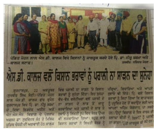
Awareness programme on 'Stubble Burn' On 24<sup>th</sup> September 2019

On 24<sup>th</sup> September 2019, NSS Unit and Central Association organized awareness programme on 'Stubble Burn' in village Babehali and Kotha Pind.