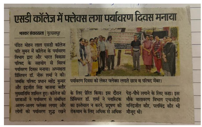
World Environment Day On 5<sup>th</sup> June 2019

• On 5<sup>th</sup> June 2019, World Environment Day was celebrated by Environment Association in collaboration with Environment Protection Society, Gurdaspur. 100 flex banners regarding environment awareness have been pasted in Gurdaspur city and surrounding areas to keep the atmosphere clean.