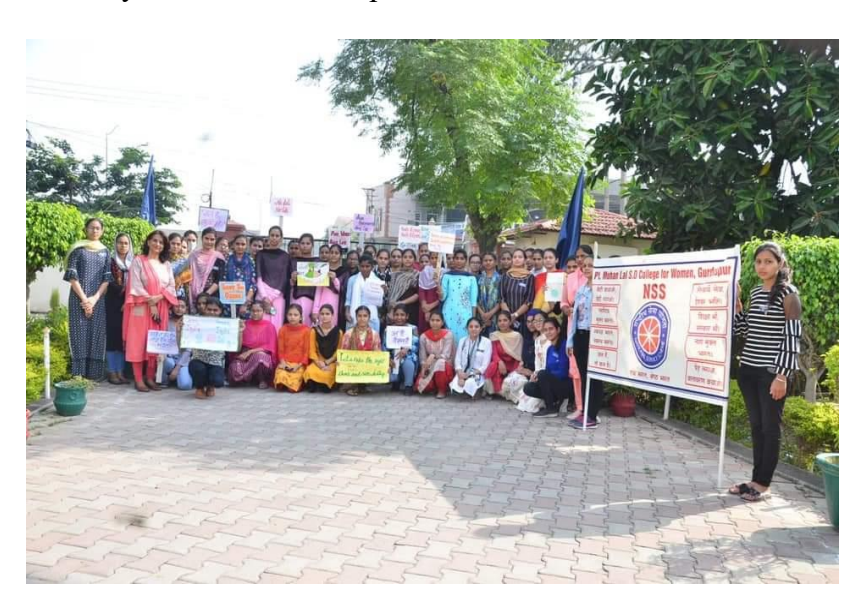
Awareness campaign On 26<sup>th</sup> August, 2019

• On 26<sup>th</sup> August, 2019 NSS Unit and Environment Association organized awareness campaign for water, electricity and environment protection.