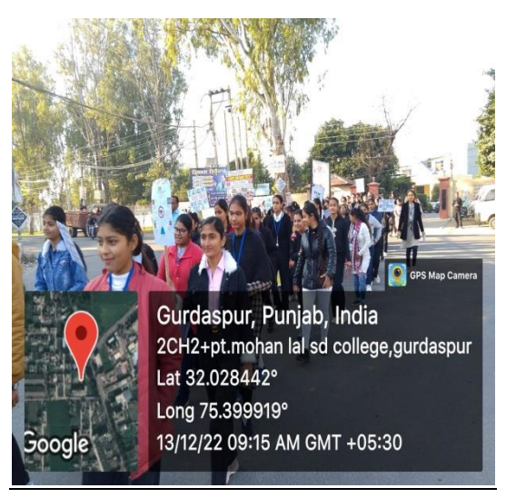
13th Dec, 2022 Awareness Rally on Swachh Bharat and Drug Abuse

On 13th Dec, 2022 Environment Association and Green club organized an 'Awareness Rally on Swachh Bharat and Drug Abuse' in collaboration with Sanjh Kendra Gurdaspur. In this rally 80 students of the college along with 10 staff members, Sanjh Kendra staff, PPM staff, committee members.