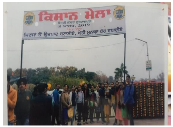
Visit To Kisan Mela 8th March 2019

• On 8<sup>th</sup> March, 2019 Science Department and Environment Association along with students visited Kisan Mela at PAU Regional Campus, Gsp. for getting knowledge and awareness regarding new technologies to be used in agricultural fields.