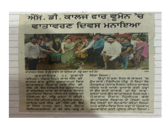
Plant Saplings 16<sup>th</sup> July 2018

• On 4<sup>th</sup> June, 2018 Govt. College, Gsp. organized quiz competition on 'World Environment Day' in which college bagged third position.