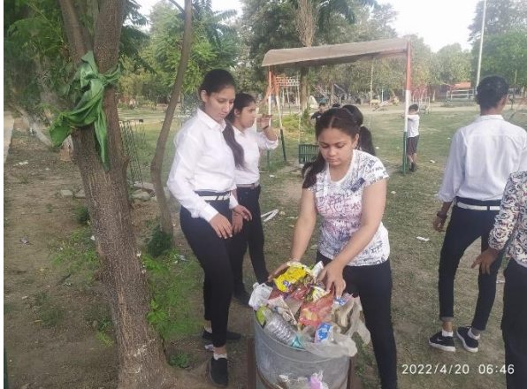
4<sup>th</sup> April, 2022 Swachh Campaign