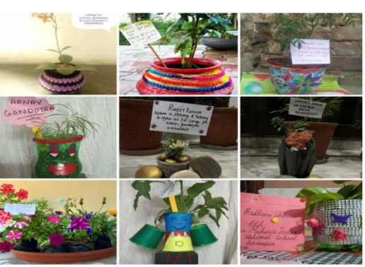
Share for Cleaner Air On 23<sup>rd</sup> May 2020