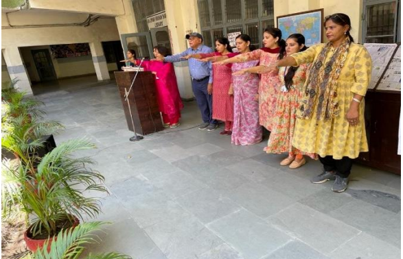
6<sup>th</sup> June, 2023 Plantation Drive

• On 30<sup>th</sup> May, 2023 a 'Plantation Drive' outside college campus was organized. The scorching heat nowadays has made difficult to step out of our home. Even birds and animals find a shelter to protect themselves from this extremely hot weather. Keeping this in mind this plantation drive was undertaken. Firstly, this area was cleaned and all the garbage lying was cleared. Then Flower saplings were sown so as to save environment from depleting and beautify the surroundings of the college.